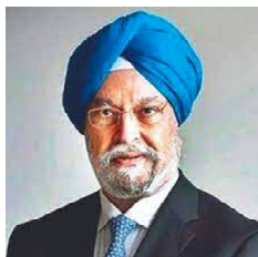
By: Hardeep S Puri

The inaugural event of the Urban 20 Engagement Group was held in Ahmedabad on 9-10 February 2023. Urban 20, or U20, is among the most influential city-level diplomacy initiatives held annually. Receiving participation from Mayors and designated 'City Sherpas' from the G20 cohort, the deliberations at U20 inform G20 negotiations and are integral to the broader discourse around urban development. The inaugural